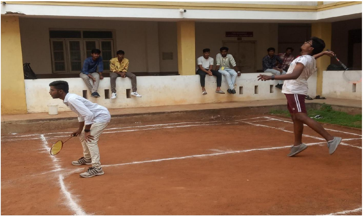
Students play the game