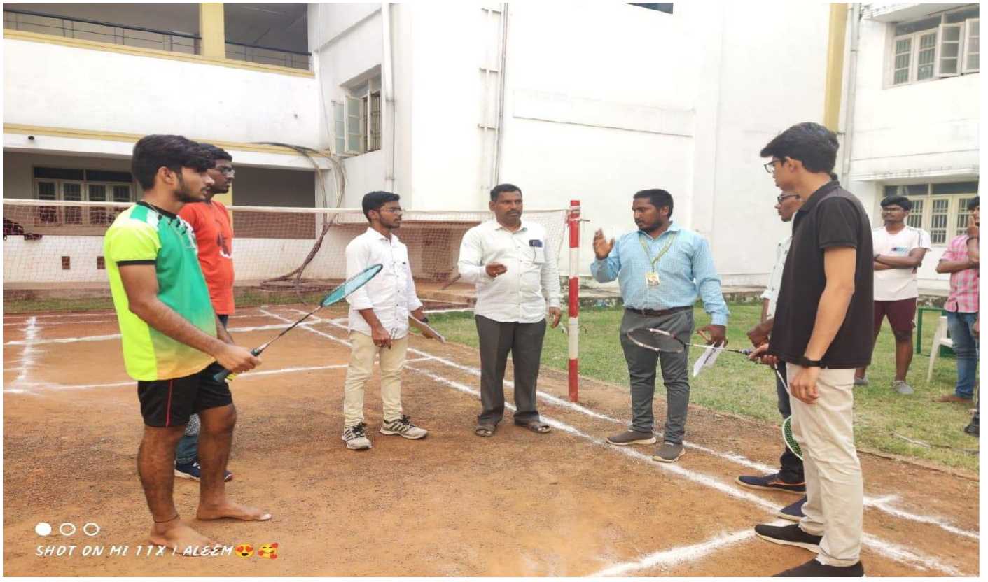
Coin Toes By The Administrative Officer